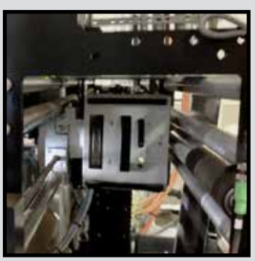
Mounted on a Vertical Bagger