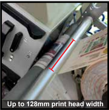
Mounted on a Continuous Flow Wrapper