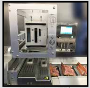
Mounted to HFFS packaging machine